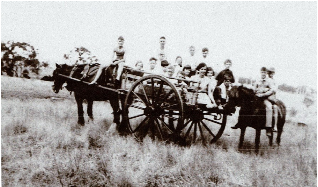
Hazelwood Ridge School students in a jinker. Maybe the lady at the back is the teacher. c1936