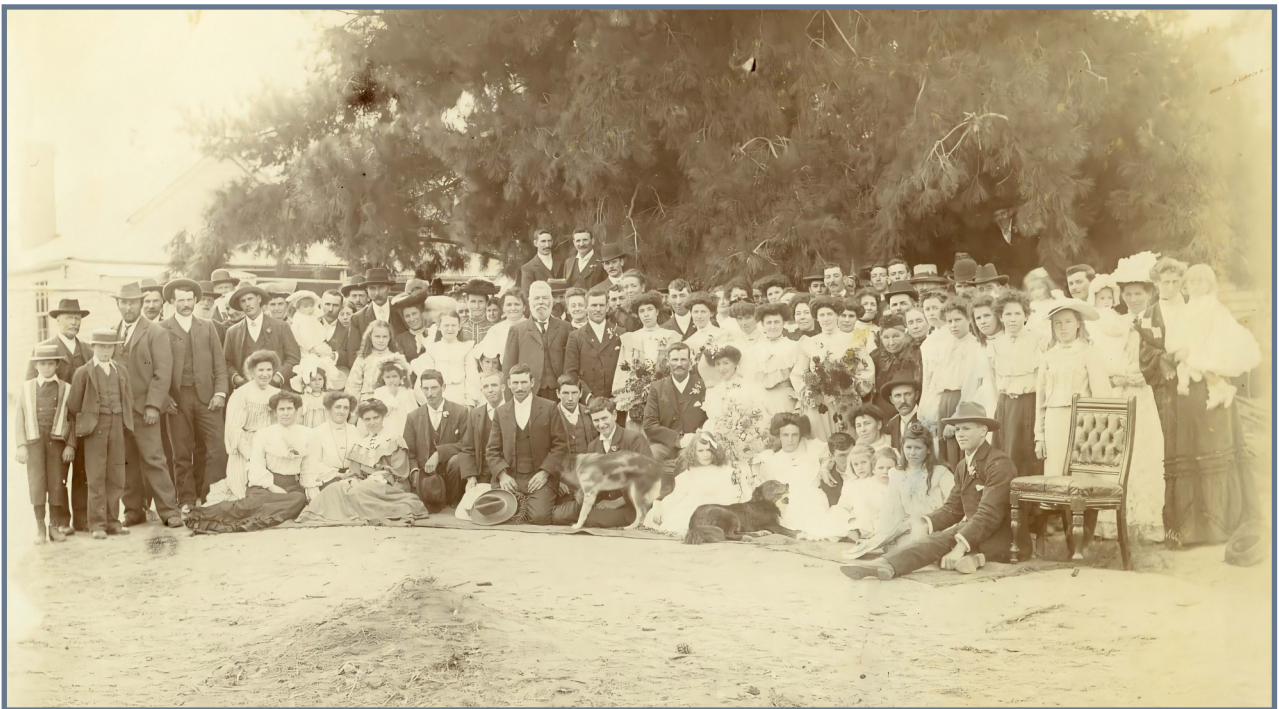
See article page 4-6