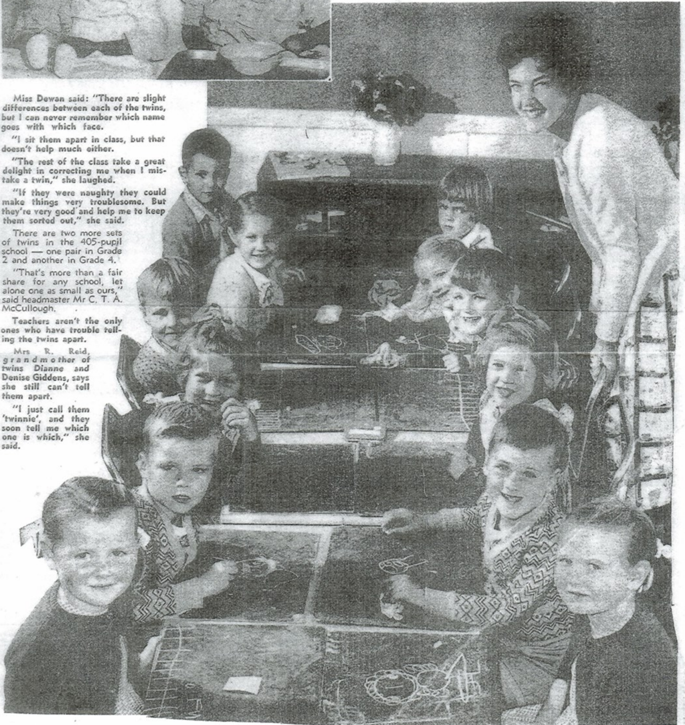
Collins Street Primary School February 20 1959 Note the Chalk and blackboard and paperless classroom

"I just call them 'twinnie', and they soon tell me which one is which," she said.