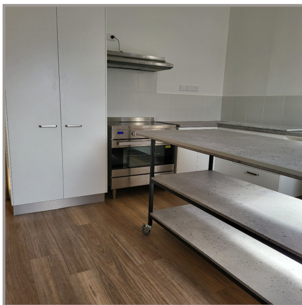
Our completed kitchen with stove and mobile steel island bench