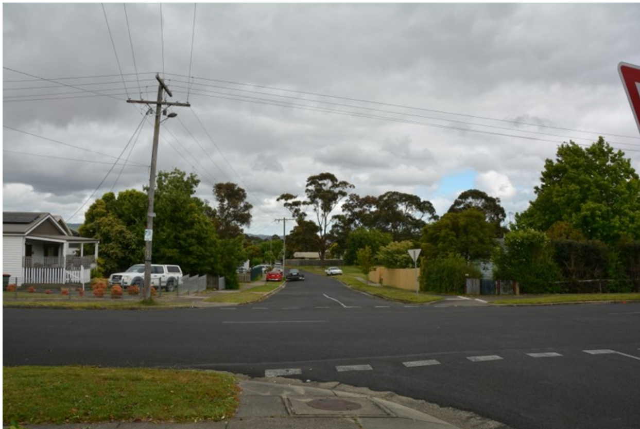
The house on the south west corner of Booth Street and Vincent Road has had a veranda added to the front.