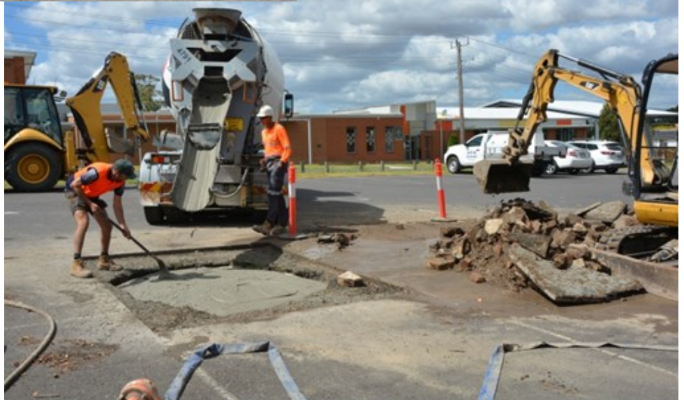
When the concrete dried, it was covered with bitumen.