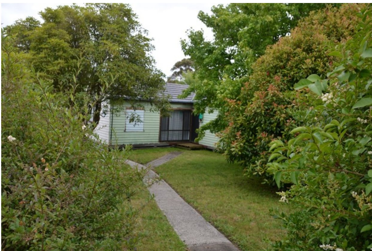
The house, 7 Booth Street, on the north- west corner of Booth St and Vincent Road has had a large window added. It has not been occupied for a while.