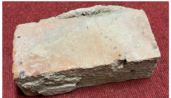
Brick from the Sacred Heart Well