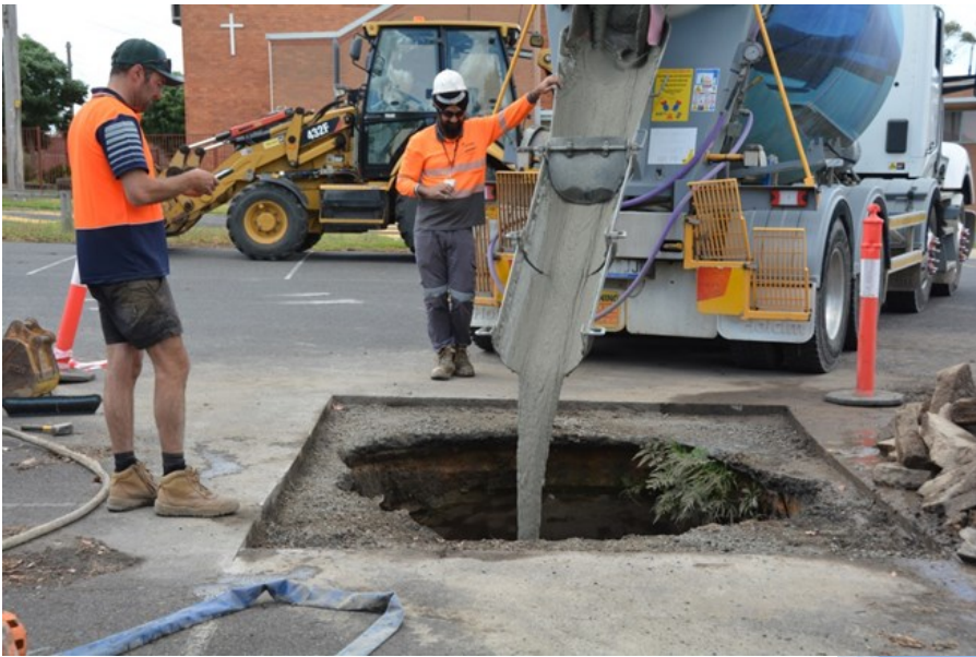
At noon the first truck load of ready mixed stabilising concrete arrived and began to fill the hole.