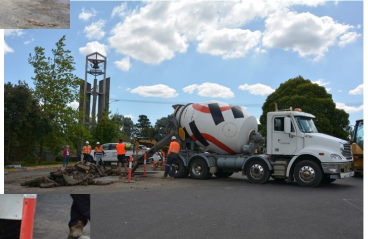
Then the 2nd truck load came. (cover photo)