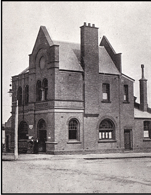
Morwell Post Office – circa 1915