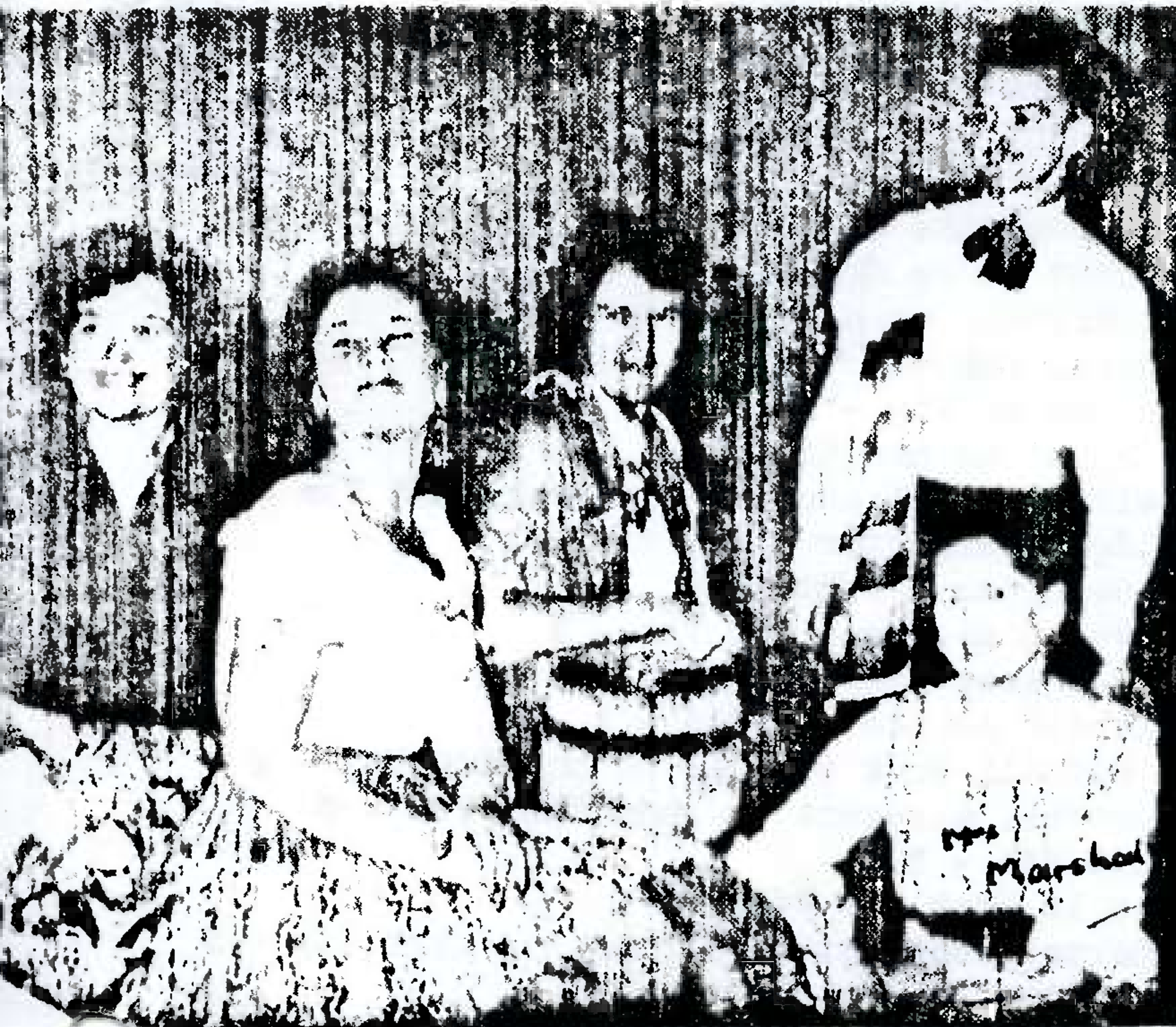
The Morwell Advertiser. 1962 ??