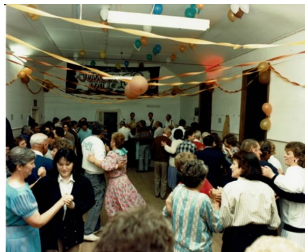
The Saturday night dance