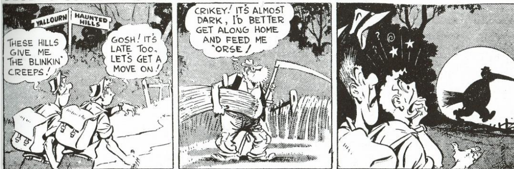
BLUEY & CURLEY : Gave Them The Bird