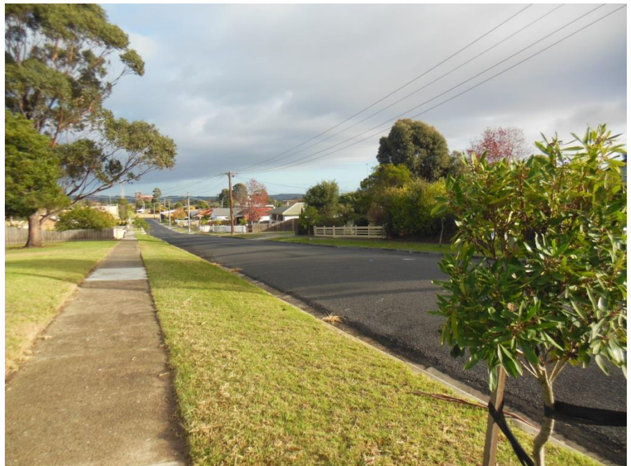
Photo taken 10th May 2018 from the top of Spry Street looking west.