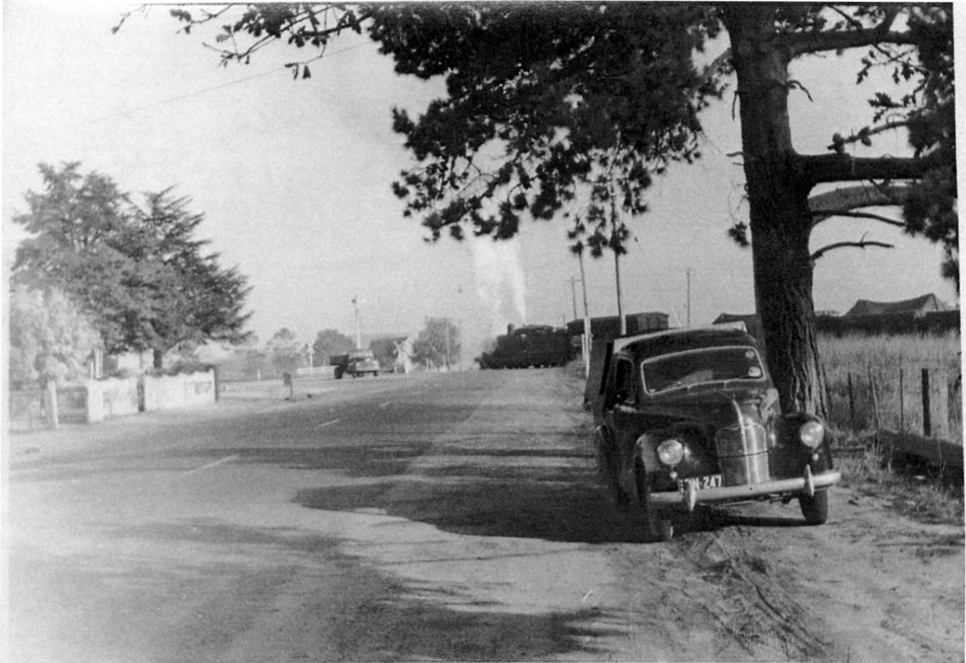
Steam train crossing Commercial Road on the Morwell to Mirboo North Railway Line 1960's

The station at Yinnar was located at the 7-mile peg, the 12-mile peg was Boolarra, the 16-mile peg was Darlimurla and the terminus was Mirboo North. Soon after opening the line a station was provided at Hazelwood and it was opened on 1st February 1888. This station closed on 22nd September 1953.