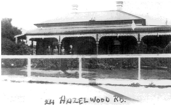
Morwell's first Hospital