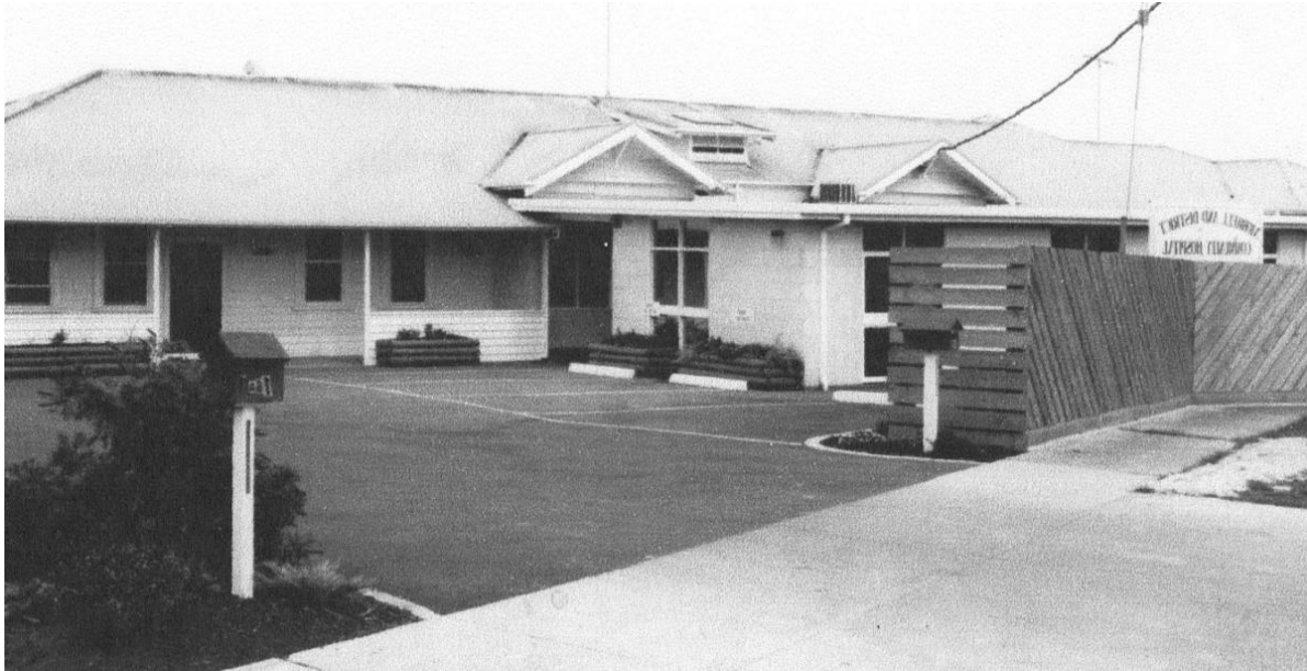
Morwell and District Community Hospital