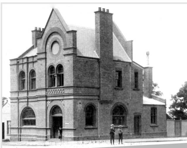
The winning post was the Post Office on the corner of Commercial Road and Tarwin Street. (Where the Commonwealth Bank was situated)