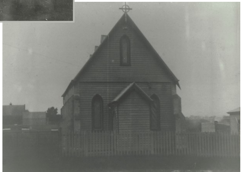
The riders went past St Mary's Church