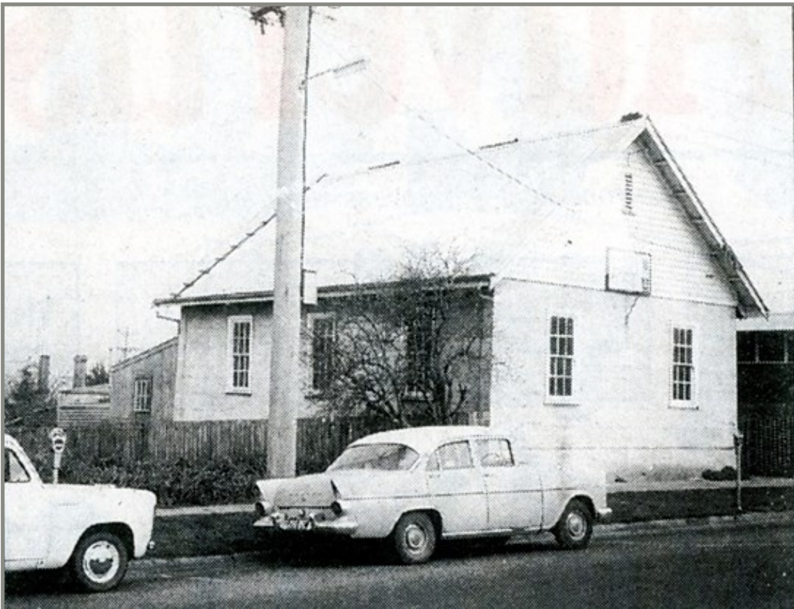
Note the 1960 FB Holden and the Parking Meters