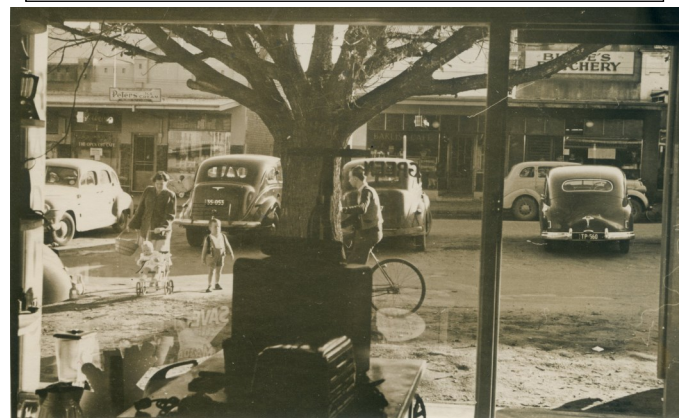
Looking out the Green's shop window towards the west side of Tarwin Street