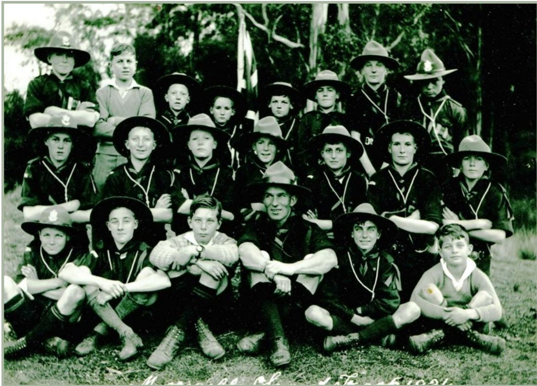
Morwell Scout Troop 1934