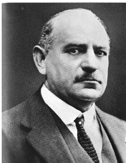
Sir John Monash