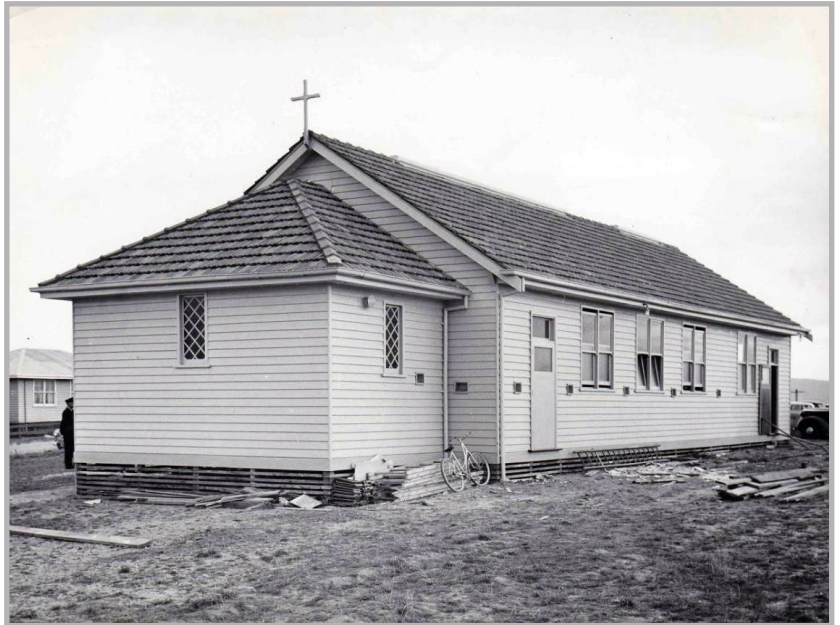
Exterior of St Phillips Church from the Sanctuary end of the church