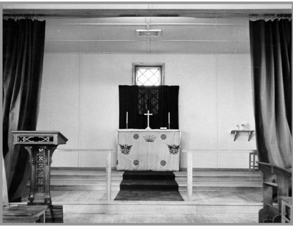
Interior of St Phillips Sanctuary