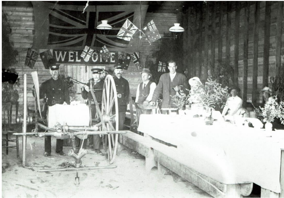
Inside the Fire Brigade Hall c1917

In 1917 the Fire Station was built beside the railway line near the Church Street level crossing. This central position gave it ready access to any part of the town