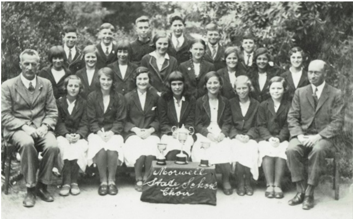
The Morwell State School Choir that won the Rural Section in Melbourne Town Hall 1934-35

Source – Morwell Advertiser . Thursday 19 July 1934 p.3