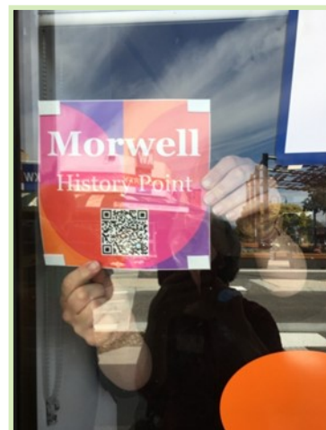
A lady in Speed Web at 215 Commercial Road putting up a History Point QR code for Legacy Place.