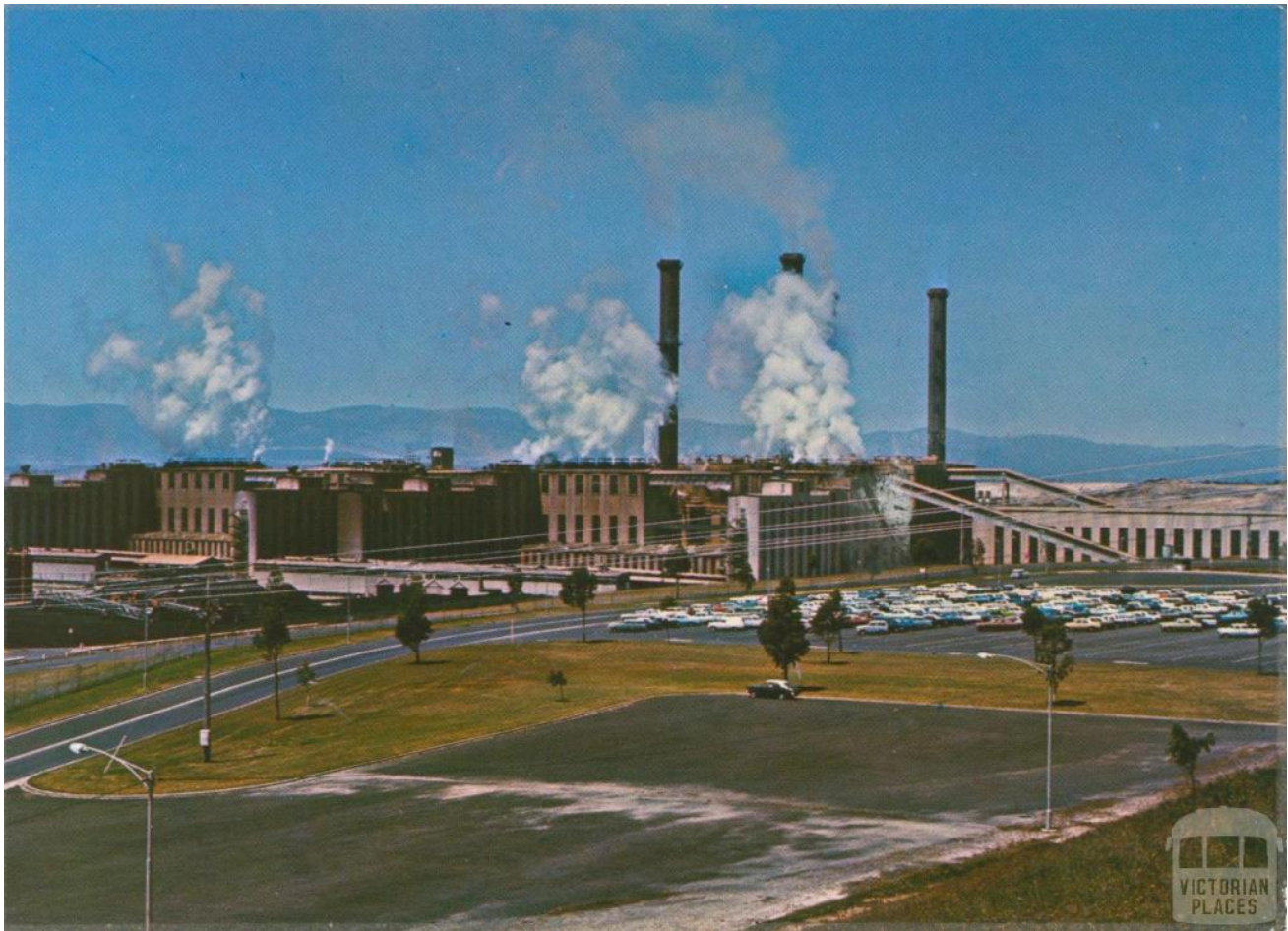
Morwell Power Station in more salubrious days – note the number of cars parked.