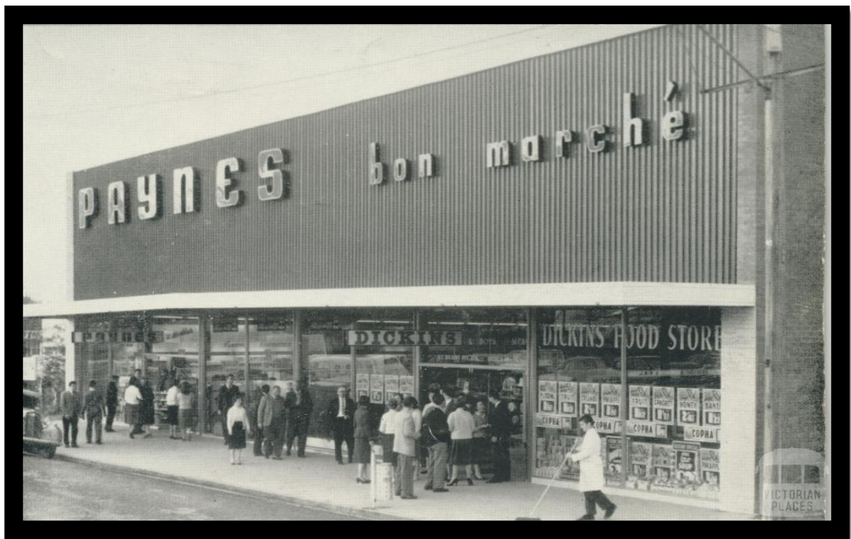
Morwell Commercial Road; 1960