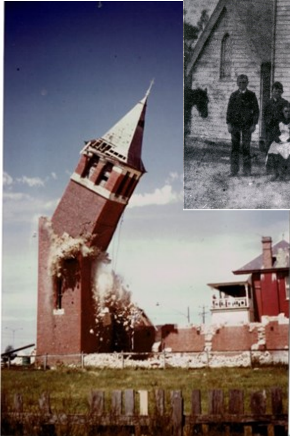
The bell tower topples

The Gippsland Times Friday 9th. December 1881 (page 3 col 3)