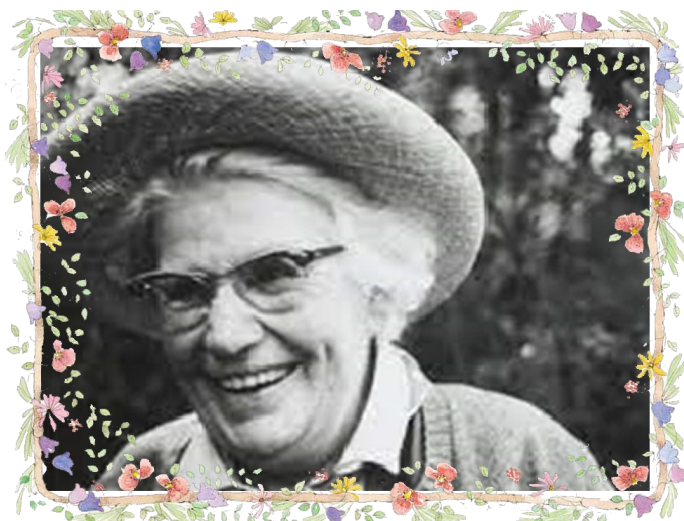
From the Morwell Advertiser 11 July 1945 p5

Miss Edna Walling, a well-known landscape artist, is responsible for the planting of the grounds, with the aid of the State Forestry Commission, and 3000 trees of different varieties have been planted.