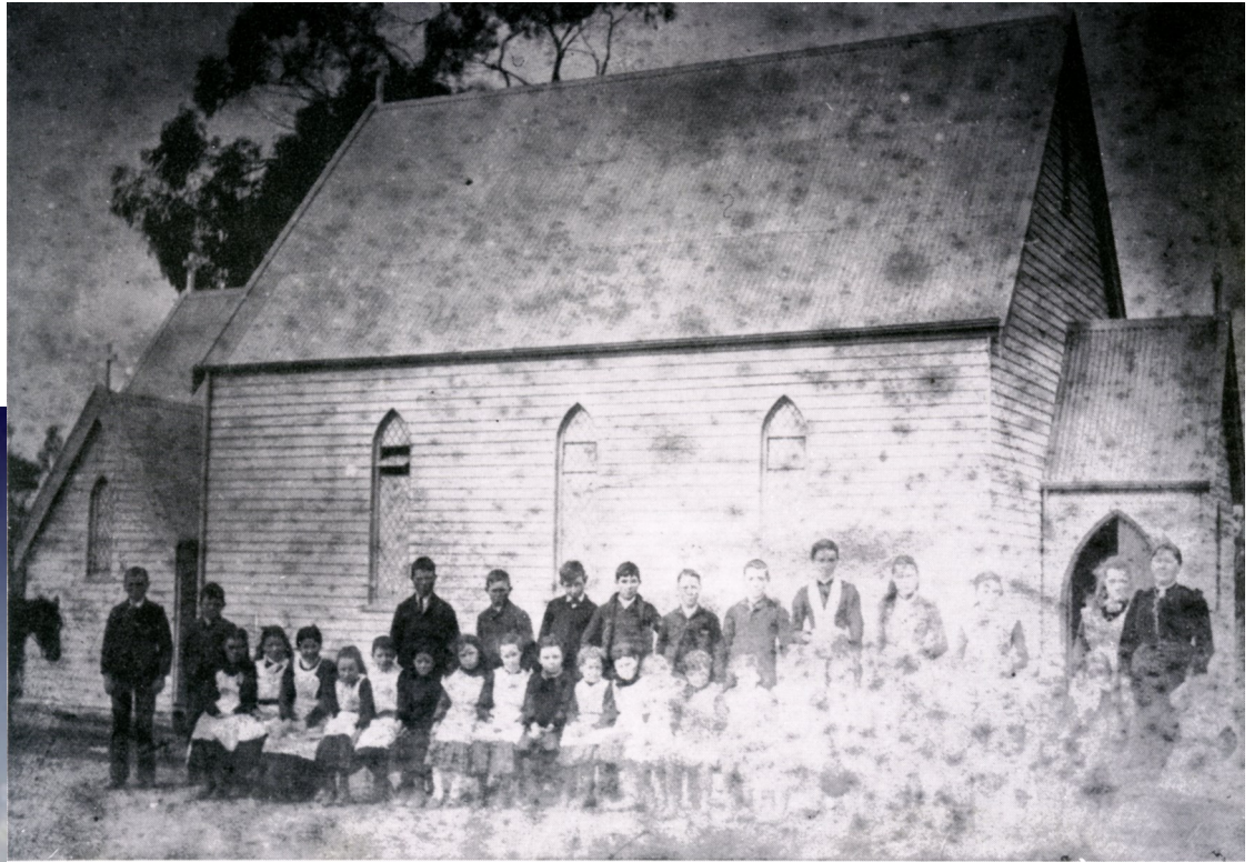
The first Sacred Heart Church in George Street.