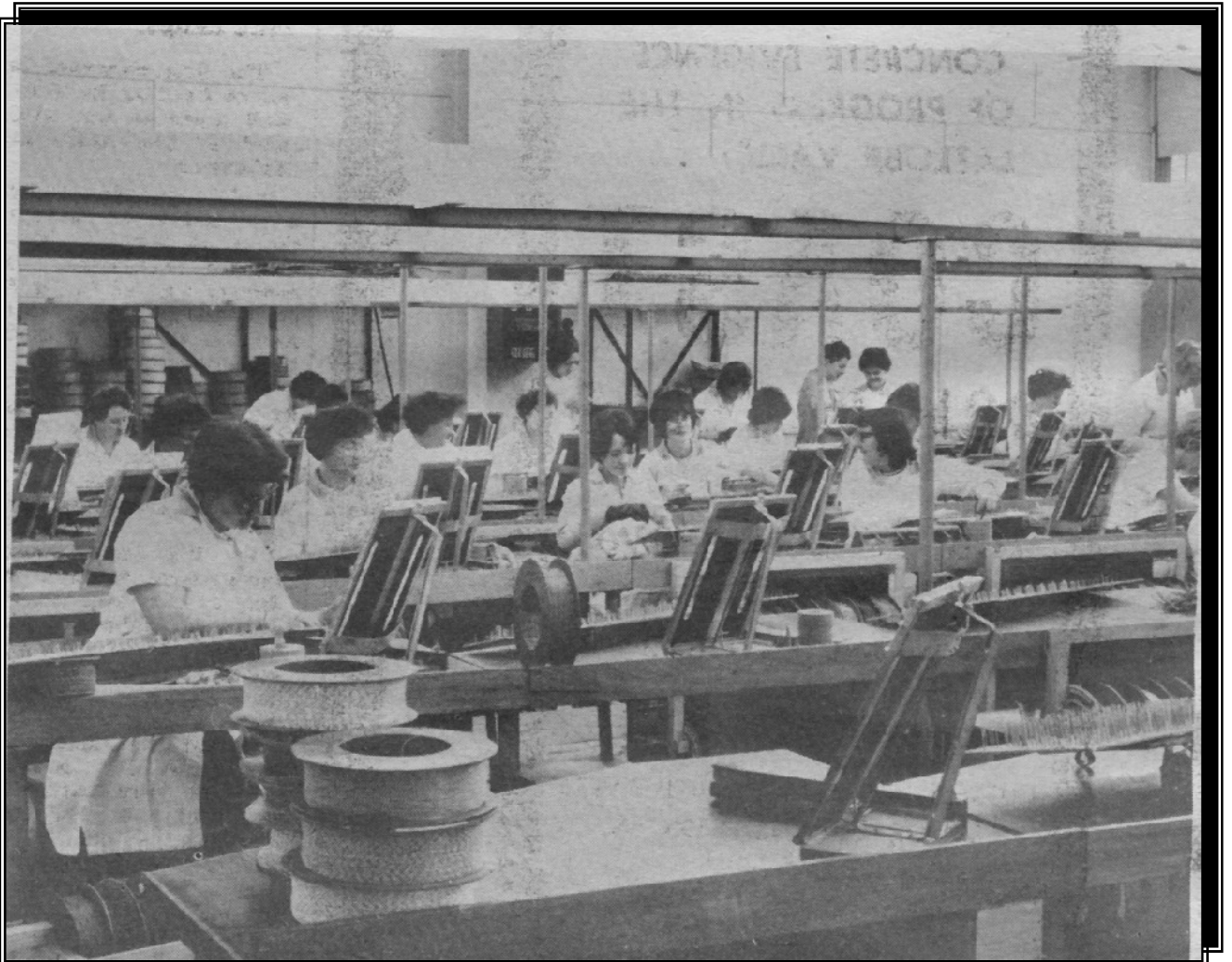
Morwell production facility - 1967

Ericsson’s closed their Morwell facility in 1988.