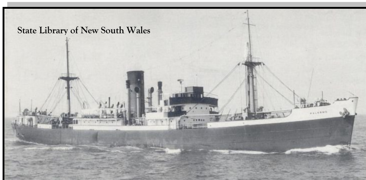
All three men sailed on the "Palermo" from Melbourne on 29 th October 1915 S.H.