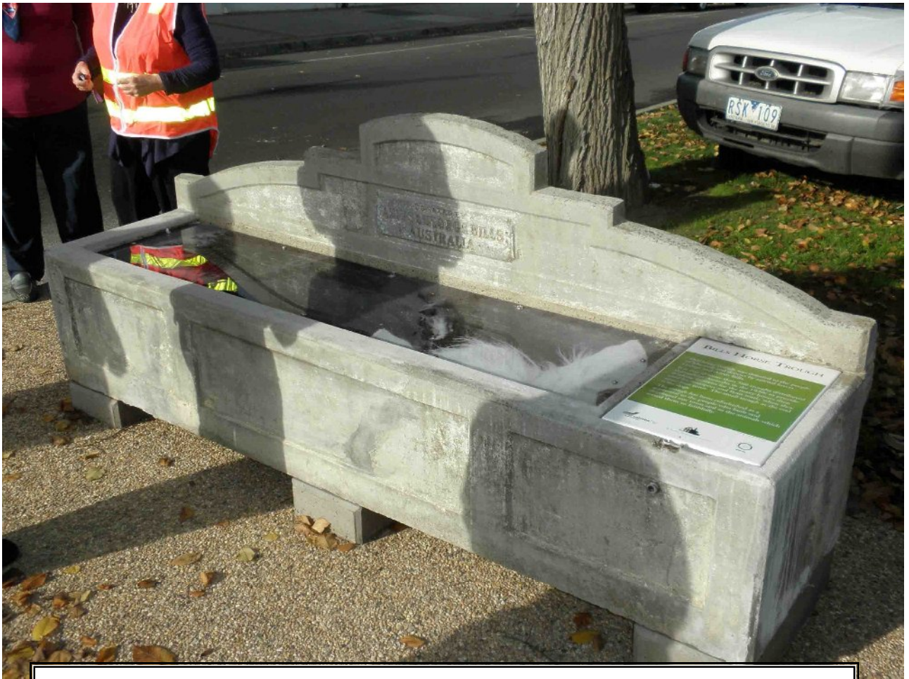
The Bills Horse Trough-Hazelwood Road Morwell June 2010