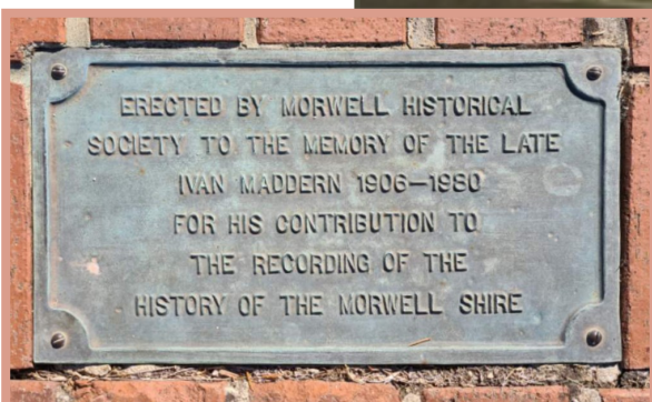
The seat in Ivan Maddern Reserve, Maryvale Crescent Morwell. Plaque just visible in the paving in front of the seat. The seat was erected on May 31st 1987