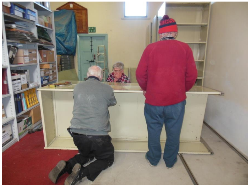
A mega huge thank you to all our members who volunteer their time.