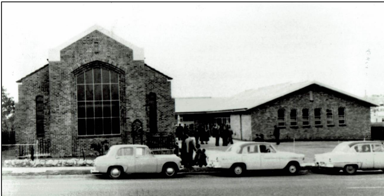
The second Methodist Church in the 1960s