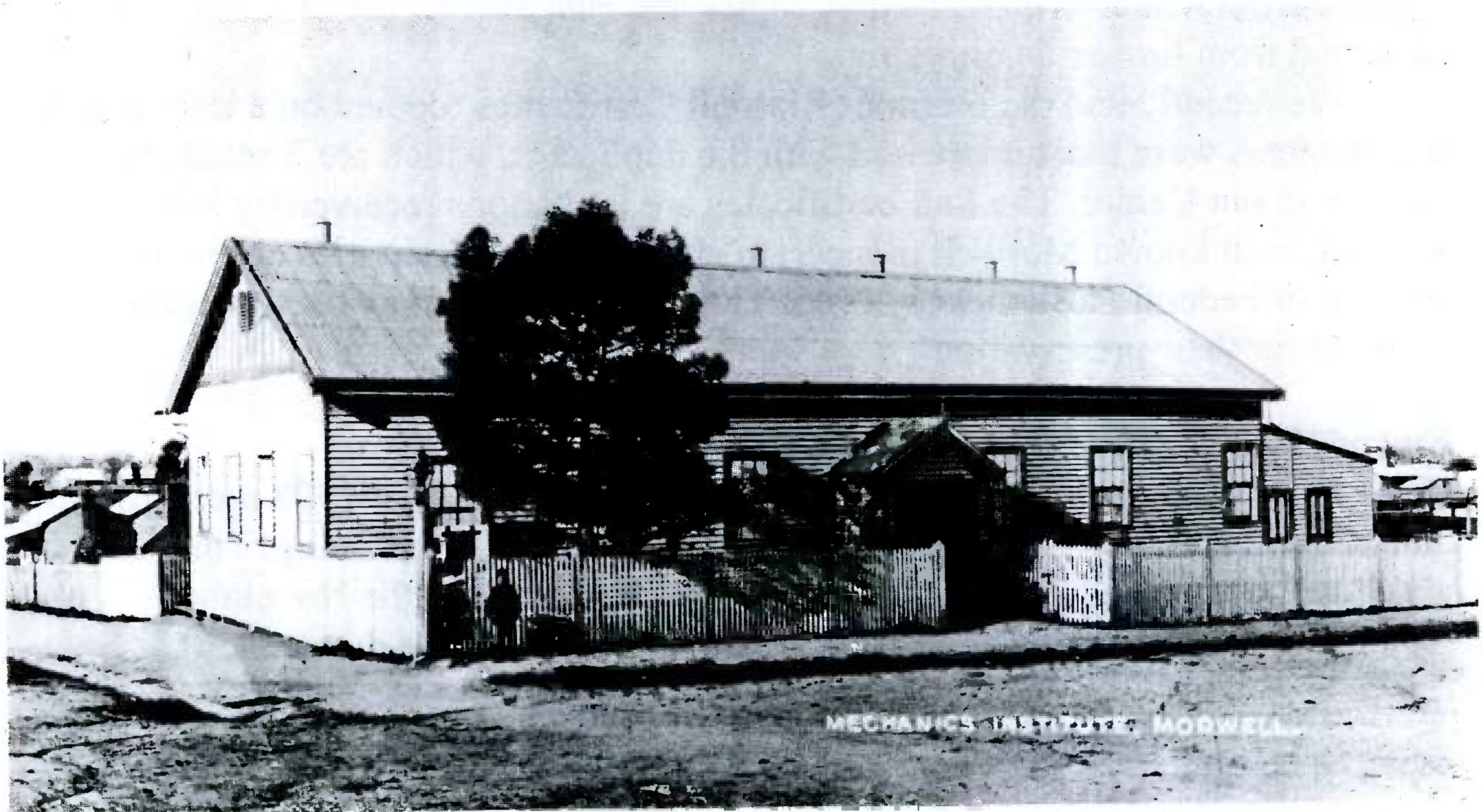
Above: The Mechanics Institute Morwell. Built about 1880 on the S.W. corner of Tarwin Street and George Street. Revamped in 1907. Burnt down in 1935.

After much argument and haggling it was decided to incorporate all the lost facilities into one new building. This building was the new Town Hall which was officially opened in October 1936.