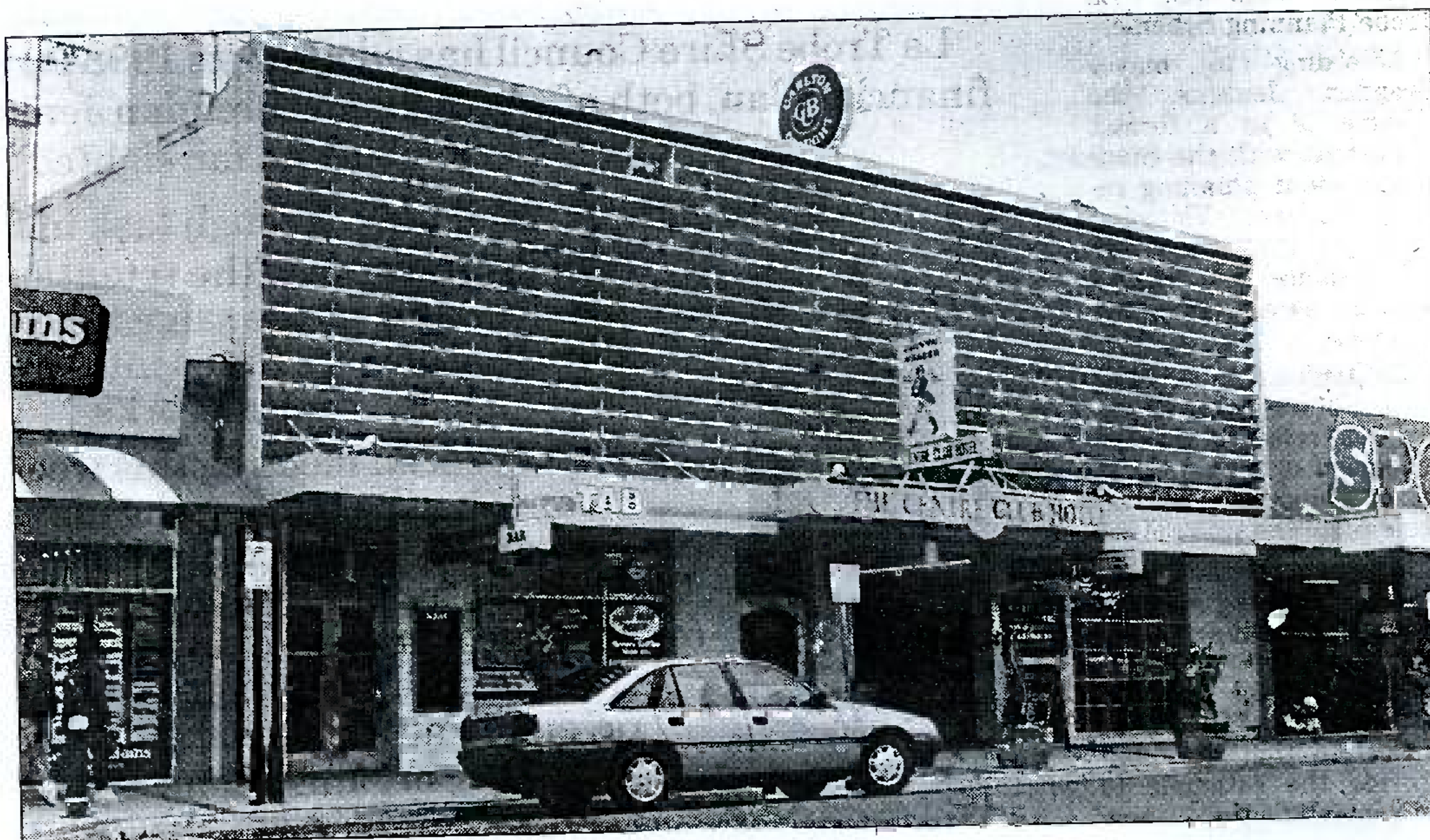
The Express, Thursday, 25 June, 1998