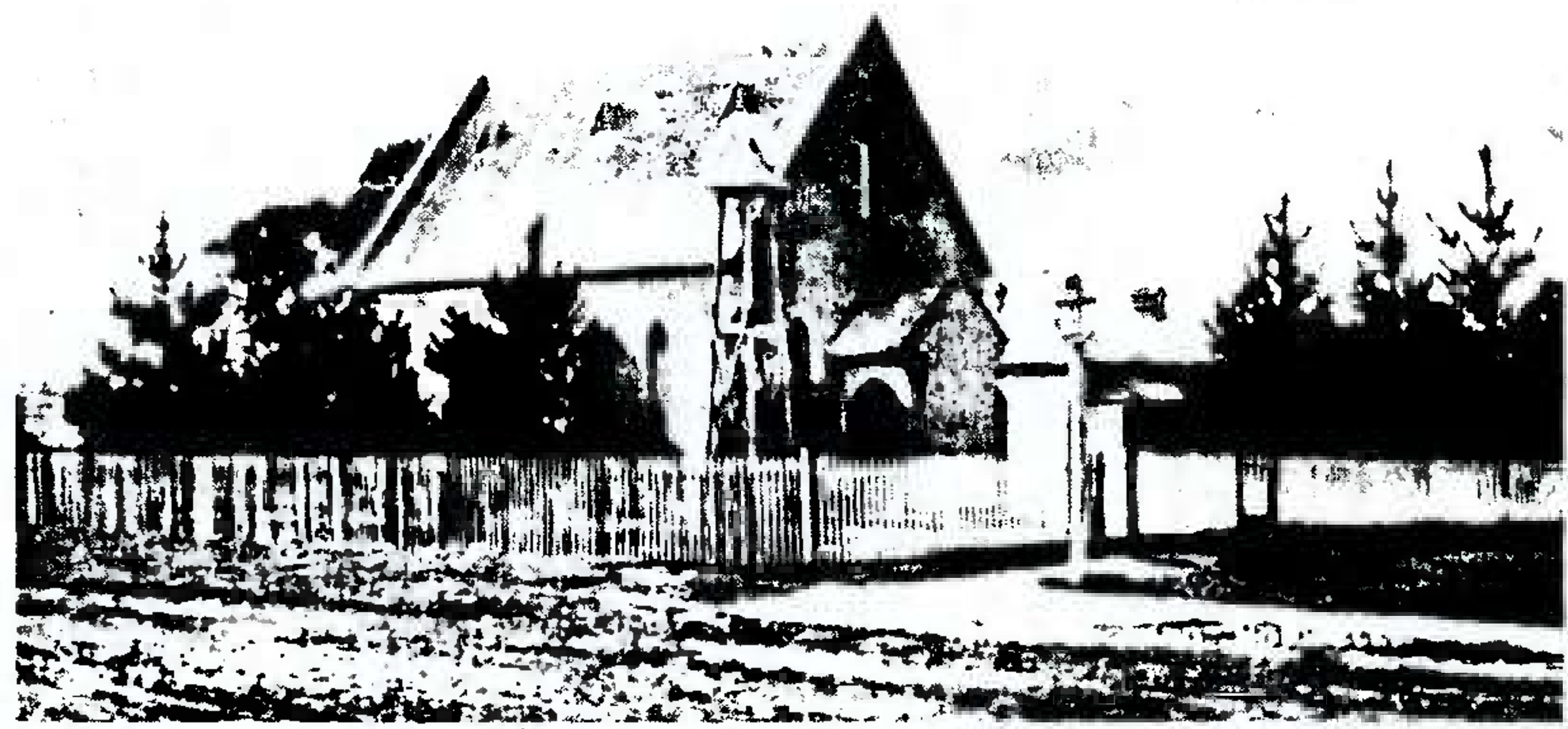
THE original Church of England on the corner of Chapel and George Sts in Morwell. This photo was taken a few years after the construction of the church in 1885. Now the church is used by the Commercial Road Primary School as a gymnasium, as pictured below, among other things such as Mothers Club meetings, socials and films.